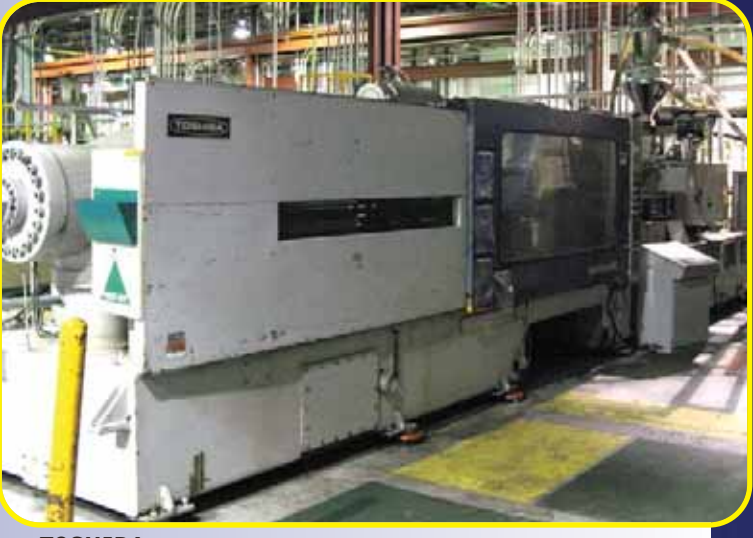
TOSHIBA, ASE-720-5413, 720 TON INJECTION MOLDER