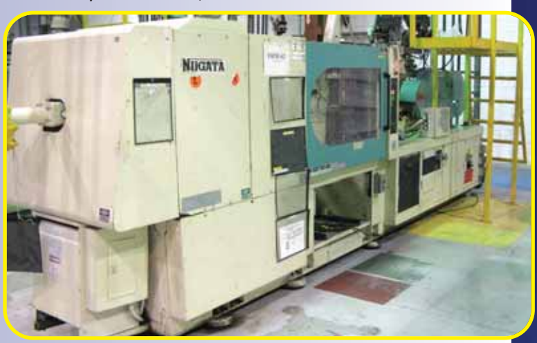
NIIGATA, NE275UA, 275 TON INJECTION MOLDER