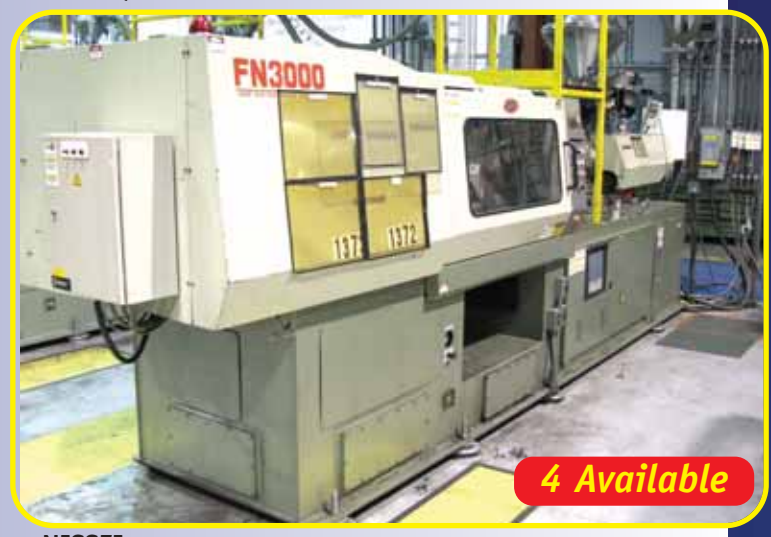
NISSEI, FN3000, 140 TON INJECTION MOLDER