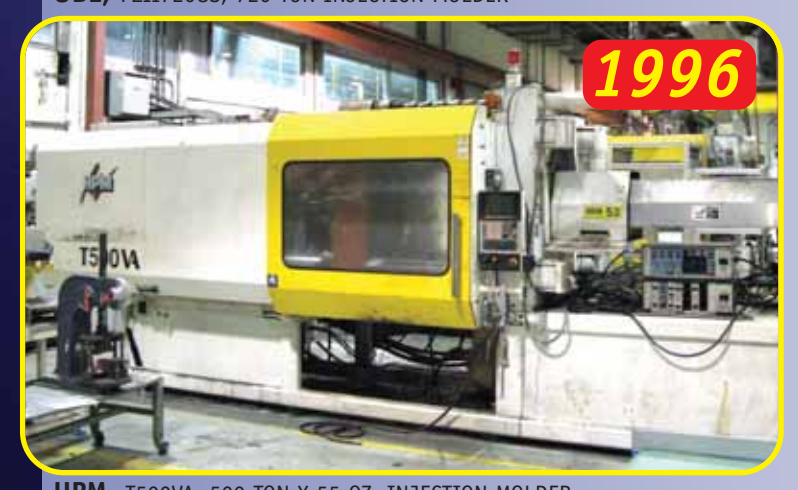
HPM, T500VA, 500 TON X 55 OZ. INJECTION MOLDER