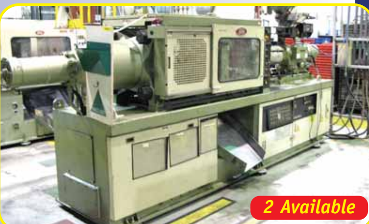
NISSEI, FS120S18ASE, 120 TON INJECTION MOLDER