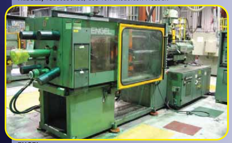
ENGEL, LS125, 125 TON INJECTION MOLDER