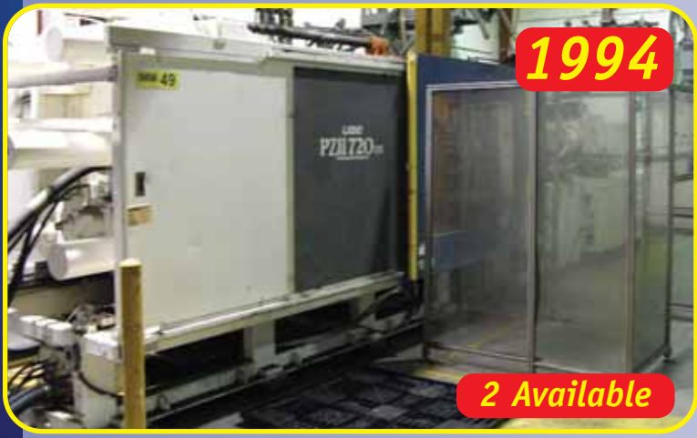
UBE, PZII720US, 720 TON INJECTION MOLDER