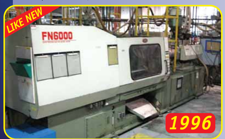
NISSEI, FN6000, 280 TON INJECTION MOLDER