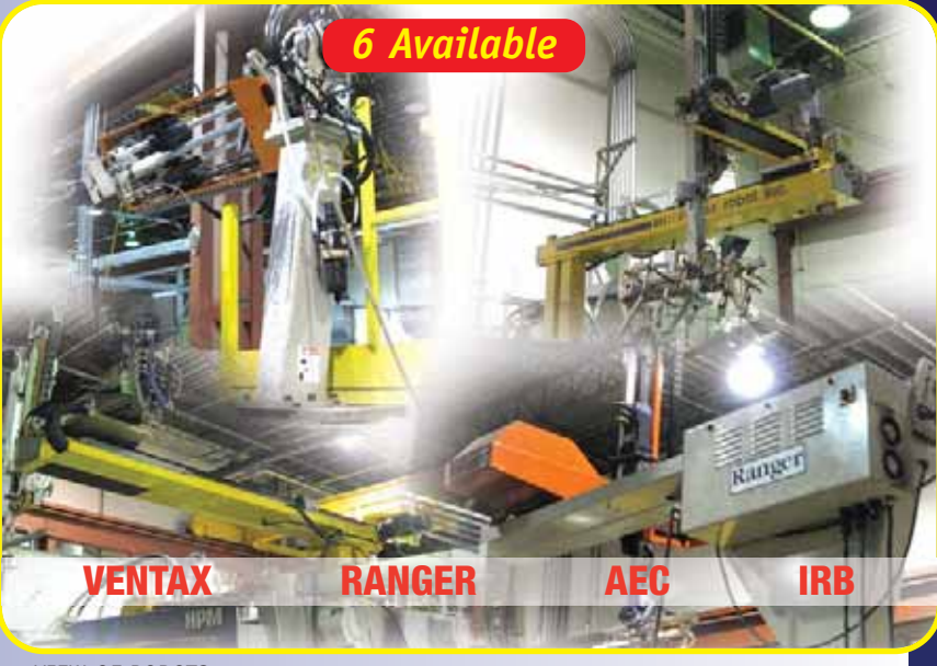
VIEW OF ROBOTS