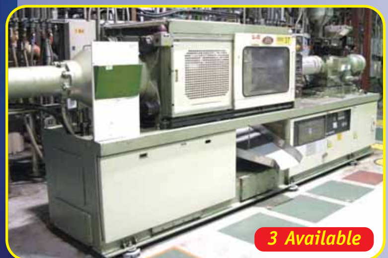
NISSEI, FS160S36ASE, 160 TON INJECTION MOLDER