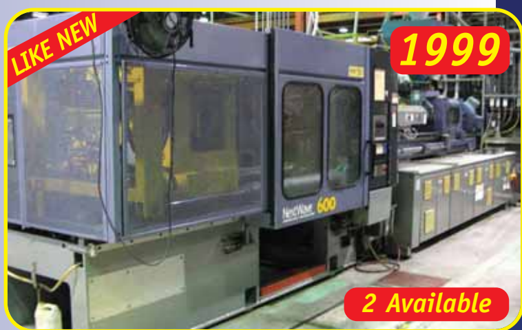
HPM, HM600-98, 600 TON INJECTION MOLDER