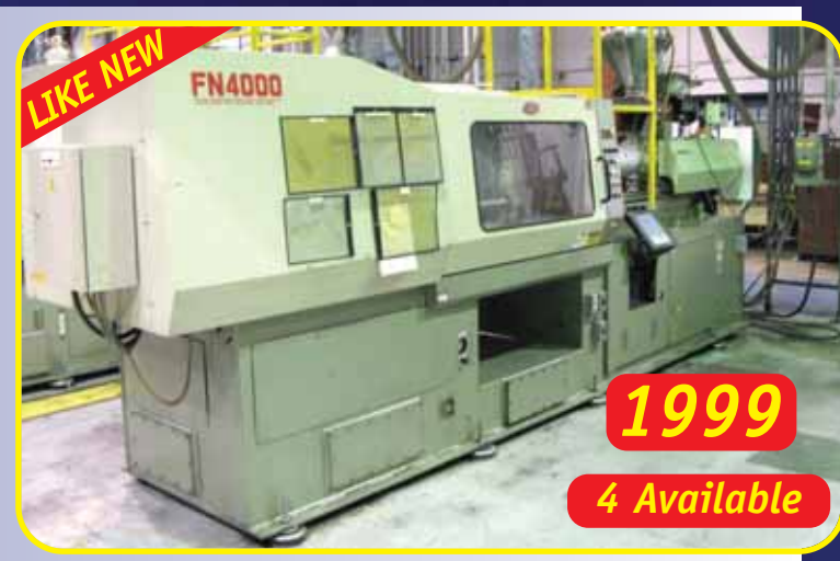
NISSEI, FN4000, 180 TON INJECTION MOLDER