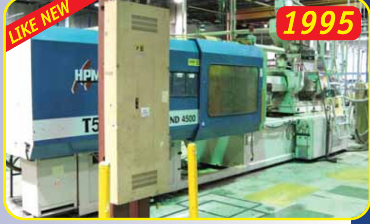
HPM, T50060VA, 500 TON INJECTION MOLDER