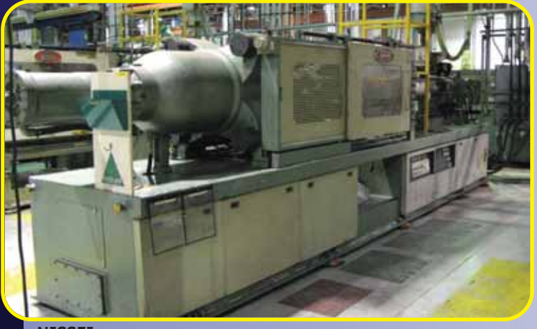
NISSEI, FS260S71ASE, 260 TON INJECTION MOLDER