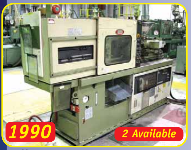
NISSEI, PS40ESASE, 40 TON INJECTION MOLDER