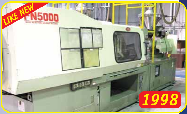
NISSEI, FN5000, 220 TON INJECTION MOLDER

type injection molder, command 500 PLC control, s/n 94664