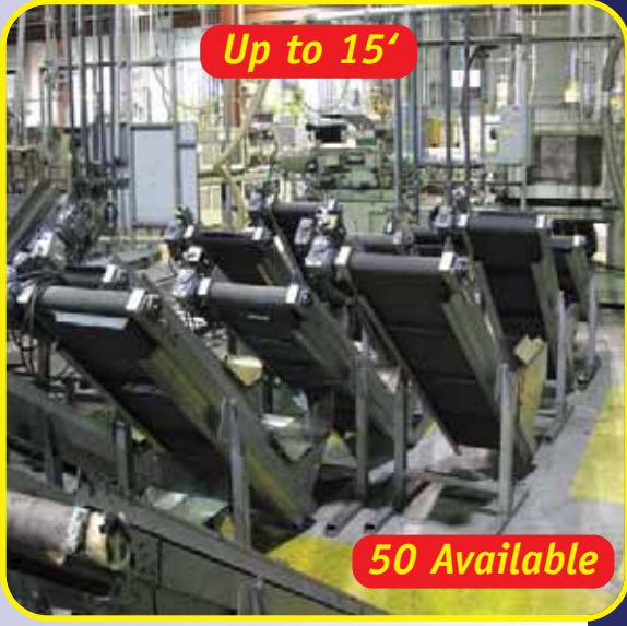
VIEW OF CONVEYORS