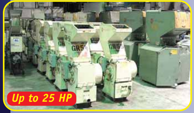
VIEW OF GRANULATORS