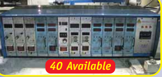
ACETRONIC & DME ZONE TEMPERATURE CONTROLLERS