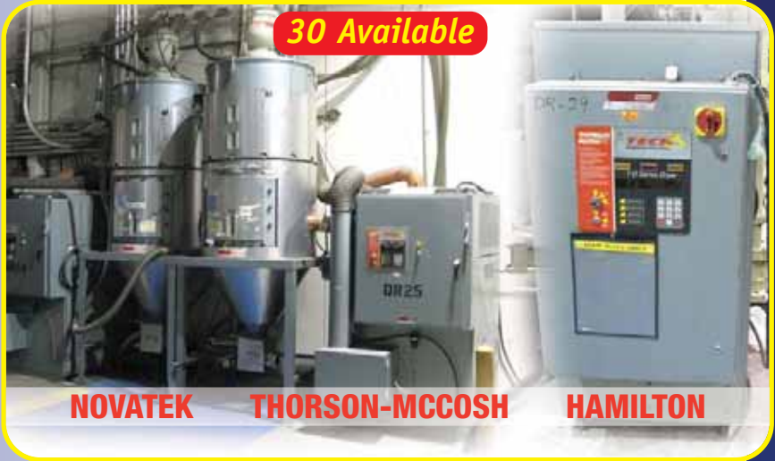
VIEW OF DRYERS