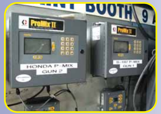
PROMOAX, II, PAINT GUN CONTROLLERS