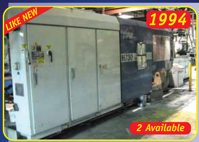
HPM, H730-80, 730 TON X 80 OZ. INJECTION MOLDER