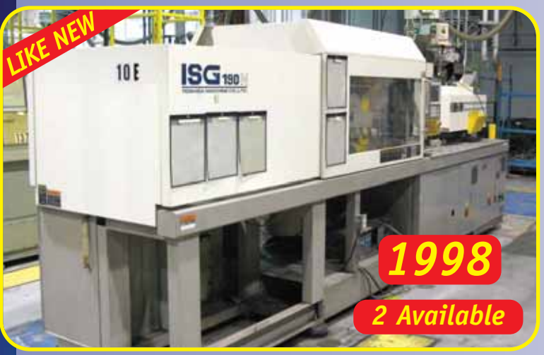
TOSHIBA, ISG190NV16-5A, 190 TON INJECTION MOLDER