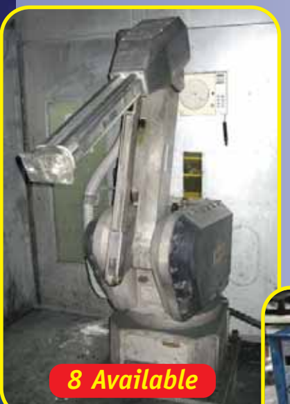
FANUC, P-100, PAINTING ROBOT