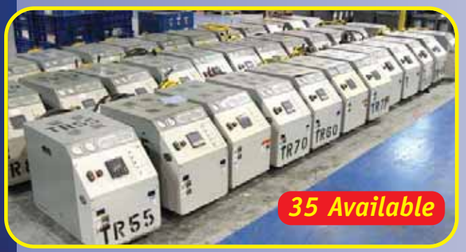
VIEW OF MOKON TEMPERATURE CONTROLLERS