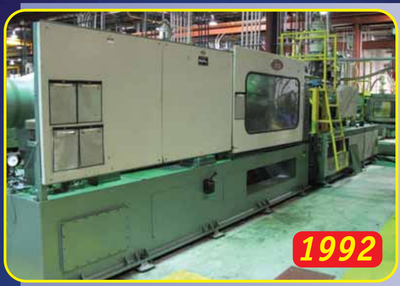
NISSEI, PS460S280BSE, 460 TON INJECTION MOLDER