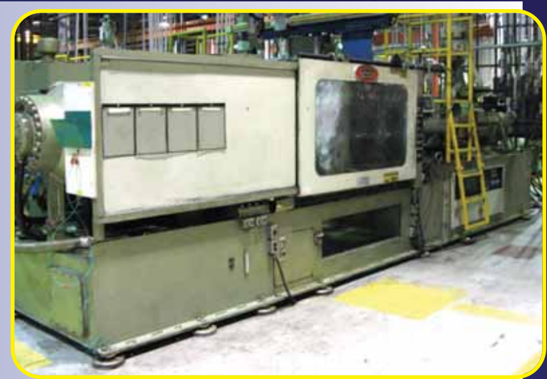
NISSEI, FE460S160ASE, 460 TON INJECTION MOLDER