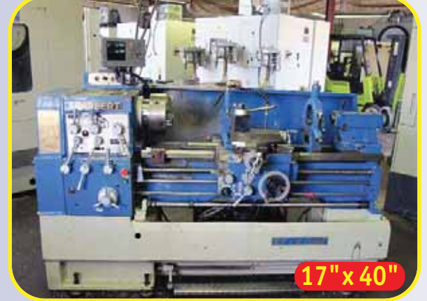
DARBERT, CY1740, ENGINE LATHE