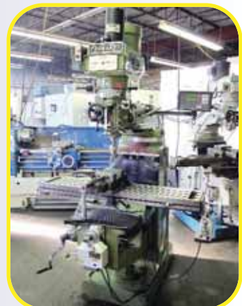
FORWARD, LVS1050R8, TURRET MILL